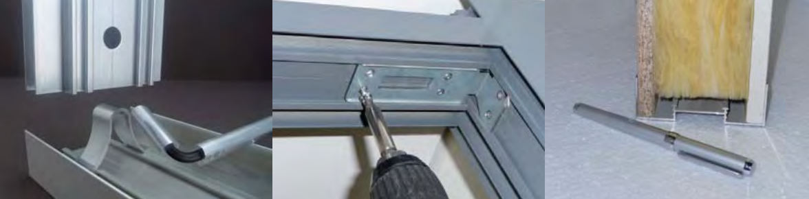
ASSEMBLY WITH SPRING AND EXCENTER