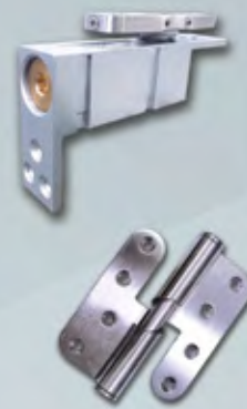
SELF RISING HINGE