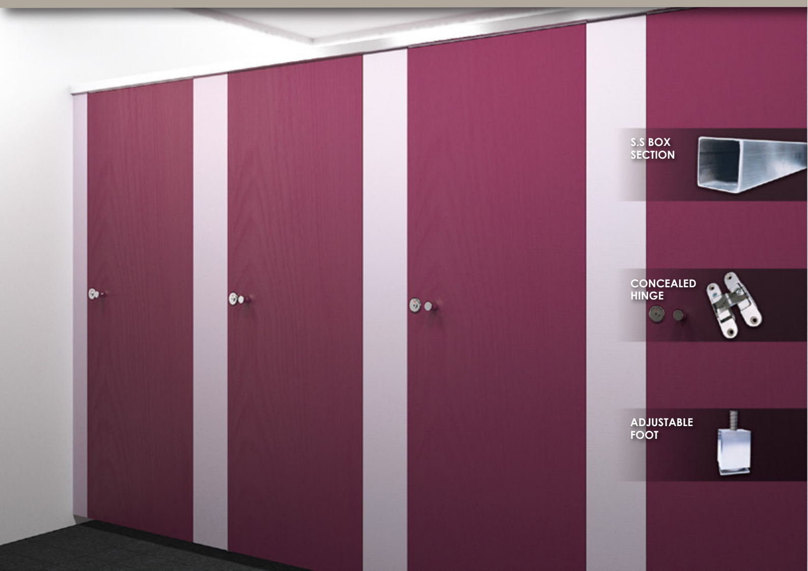
S.S BOX SECTION