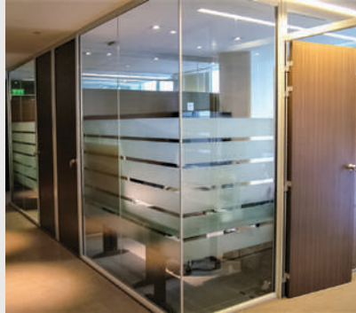
GLAZED & SOLID OFFICE PARTITION SYSTEMS