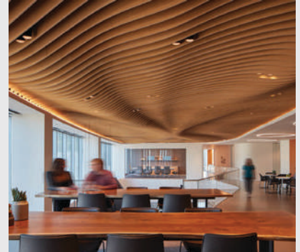
ACOUSTIC CEILING DESIGN SOLUTIONS