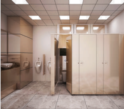
COMPACT LAMINATE SOLUTIONS