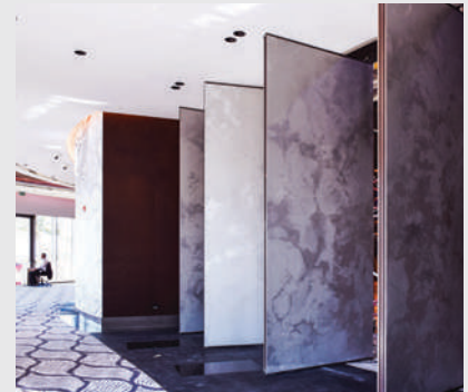
ACOUSTIC PIVOT DOORS