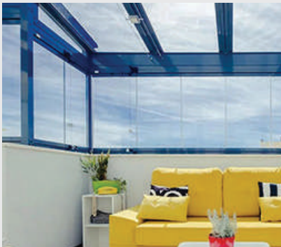
CLIMATE-CONTROLLED GLASS ENCLOSURES