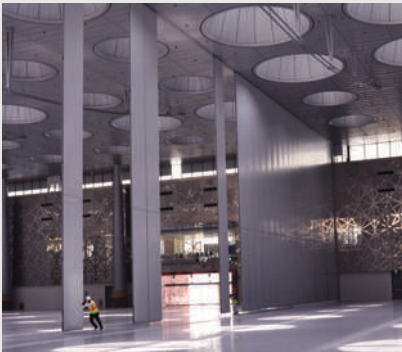
ACOUSTIC OPERABLE WALLS & MOVABLE GLASS WALLS