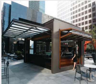
HYDRAULIFT ARCHITECTURAL DOORS & WINDOWS