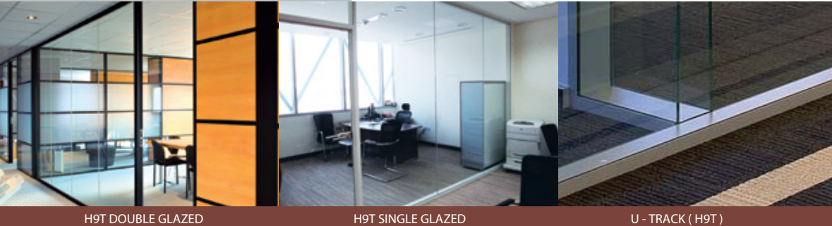
H9T DOUBLE GLAZED